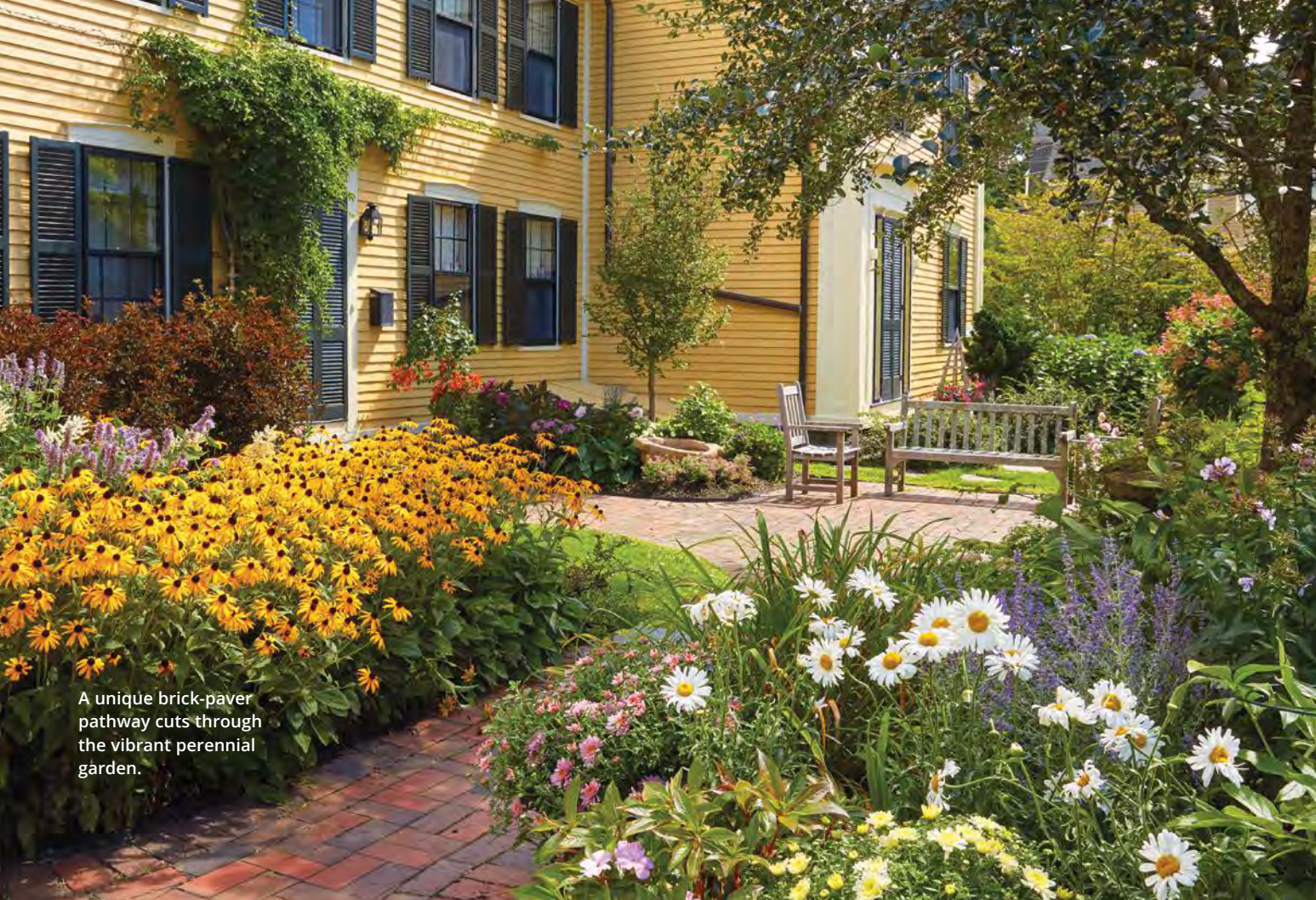
A unique brick-paver pathway cuts through the vibrant perennial garden.

daisies, and more sway in the summer months and make way for blooming asters and bellflowers come autumn. A unique brick-paver pathway carves a walking route through the garden. “I staged this project—like most of my work—with multiseason flowering plants so the visual interest extends year-round,” Ted says.